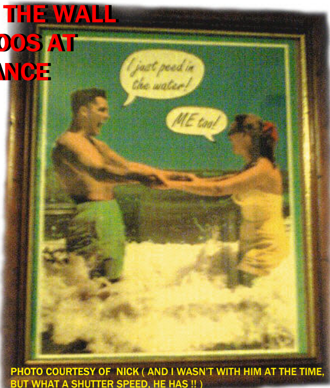
( AND I WASN'T WITH HIM AT THE TIME, BUT WHAT A SHUTTER SPEED, HE HAS !! )

Note:- If anyone has similar Photos they would like Included in the next issue, feel free to pass them on to one of the band members.